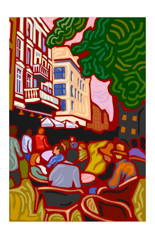
Portugal is experiencing an increase in tourism throughout the land (2014)

In order to achieve this target, more rural regions of the country introduced more groundbreaking incentives to investors seeking to explore investment opportunities in regions such as the Azores, Madeira and Porto.